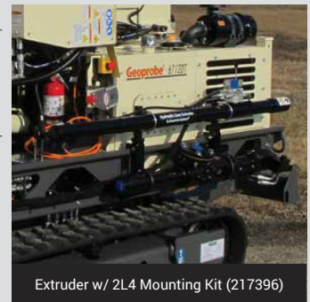
Extruder w/ 2L4 Mounting Kit (217396)