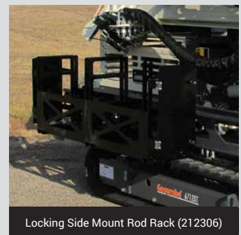
Locking Side Mount Rod Rack (212306)

Rig shown with optional features. Weights & dimensions subject to change without notice.