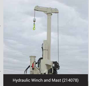
Hydraulic Winch and Mast (214078)

The track section of the 6712DT is lowered to a site on the mountainside to advance 4.25 in. hollow stem augers to install 2.0 in. monitoring wells.