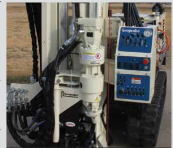
2 Speed Augerhead Attachment (213942)