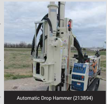
Automatic Drop Hammer (213894)